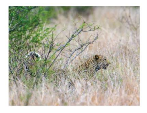
What do you see now?

What do you see? Can anyone spot the hazard in this image?